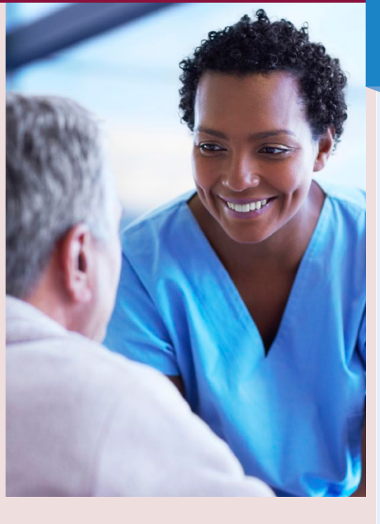
Every new venous thromboembolism increases a hospital stay by around 8 days*