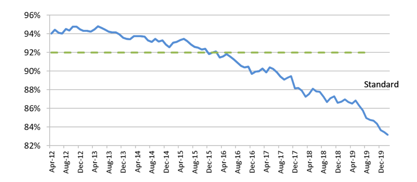
Chart 1: % of incomplete pathways within 18 weeks (published figures)