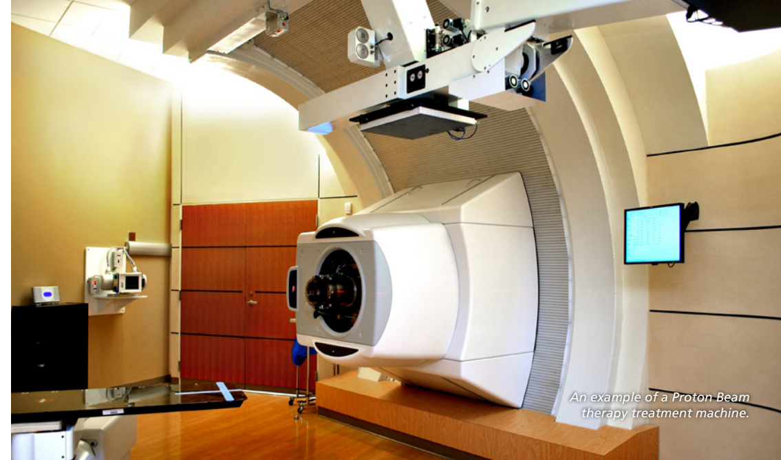
An example of a Proton Beam therapy treatment machine.

Proton Beam Therapy is a type of radiotherapy. It uses protons, which are small parts of atoms, rather than high energy X-rays. This particular type of radiotherapy enables a dose of high energy protons to be targeted directly at a tumour whilst significantly reducing the dose to surrounding healthy tissues and vital organs.