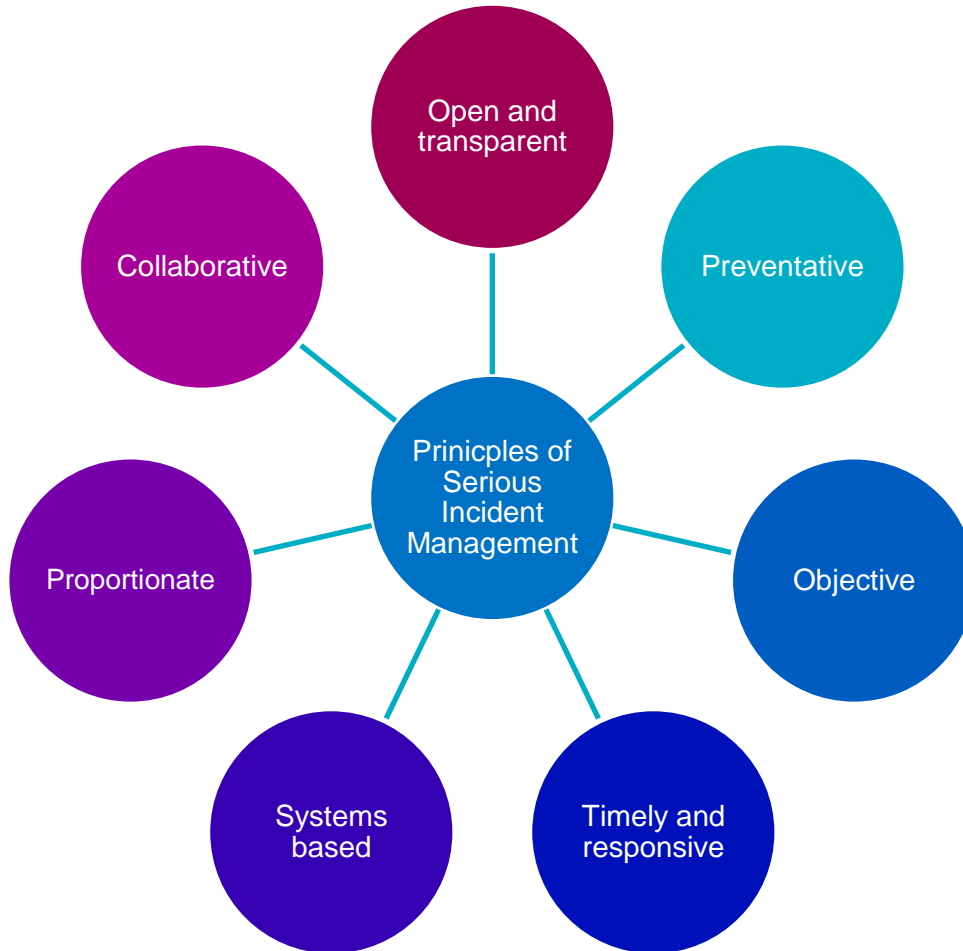
Figure 1: Principles of Serious Incident Management

This Framework endorses the application of 7 key principles in the management of all serious incidents: