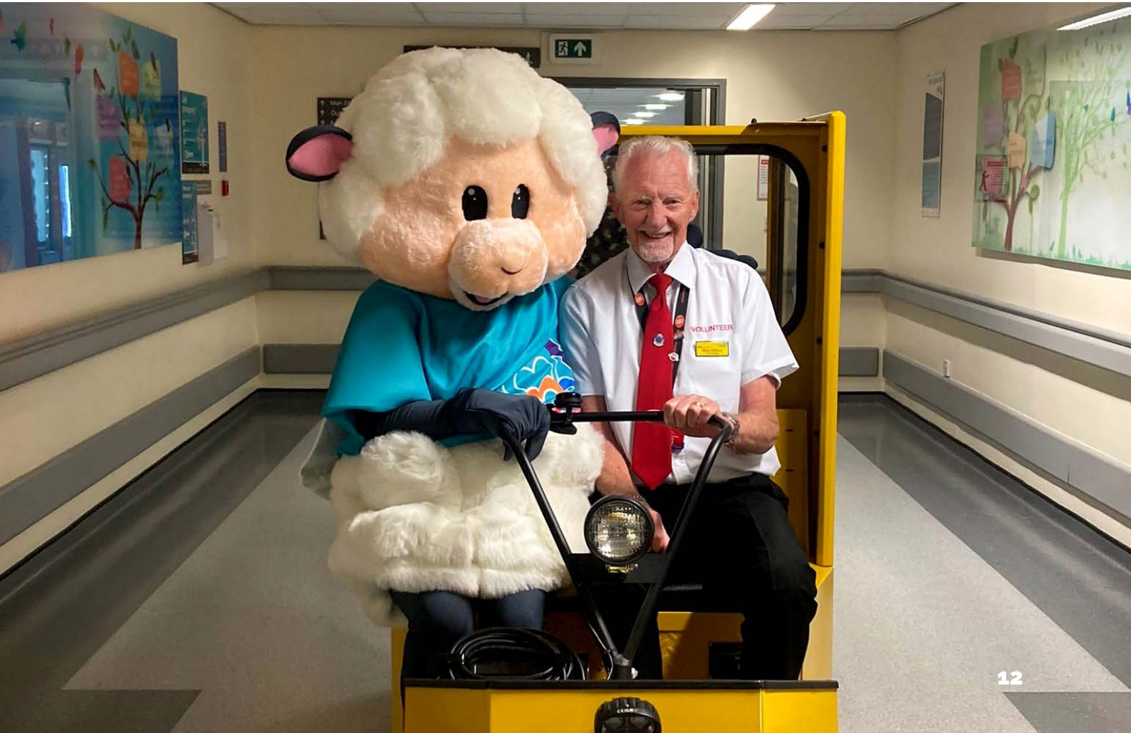
Lambie the Charity mascot on board the volunteer buggy, joint funded by DBHC and Friends of RDH.