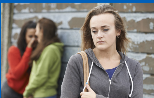
Trust tackles long waiting times for young people's mental health services