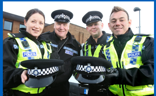
Nurses on the beat help keep vulnerable people out of police cells