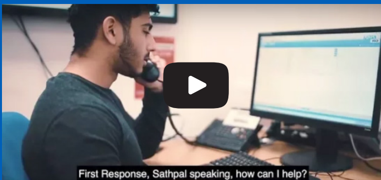
Safer spaces available through our award-winning First Response service