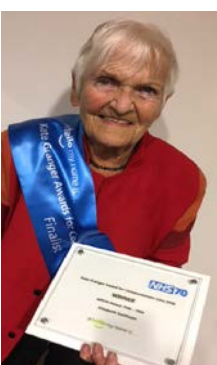
NHS Parliamentary Awards

https://www.slideshare.net/HorizonsCIC/transforming-perceptions-of-nursing-and-midwifery-april-30-day-challenge-resource-pack-140567632