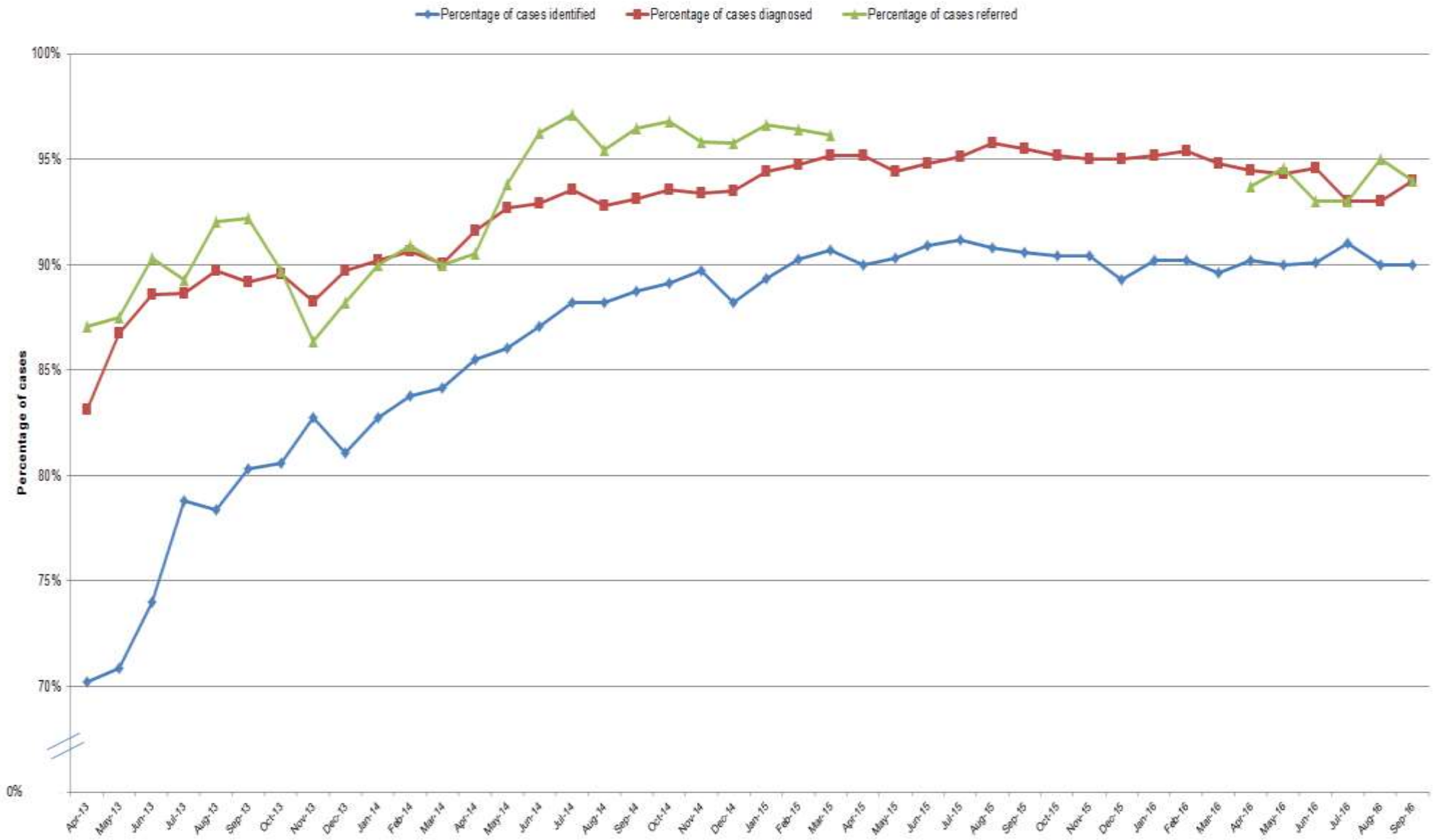
Figure 1. Acute Trusts FAIR cases identified (given case finding), diagnosed (further assessed) and referred, April 2013 – September 2016, England