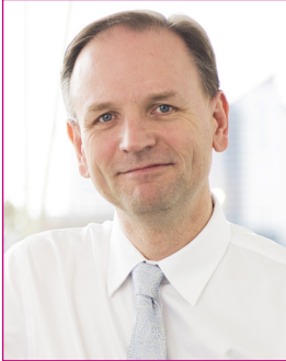
Simon Stevens, Chief Executive, NHS England

If we get this right, people's lives will be transformed and we will also achieve much better use of public money. However we know that there are many problems to overcome, including structural, financial and cultural barriers that get in the way of change happening at scale. We also know that the NHS and local authorities are stretched, and money is tight. We are committed to working together in a way that supports innovation and experimentation, then scaled to ensure wide input and improvement.