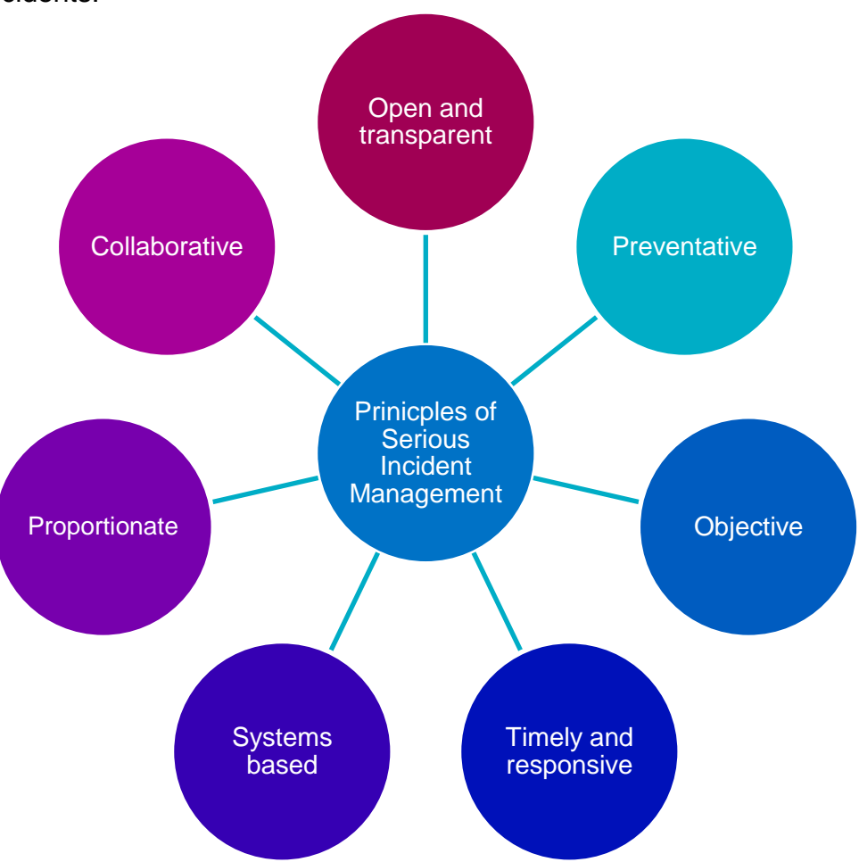
Figure 1: Principles of Serious Incident Management

This Framework endorses the application of 7 key principles in the management of all serious incidents: