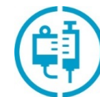
Table usage notes: 'Single container' tables are for products which are able to be supplied as a single unit, such as an infusion bag, one syringe, or as an infusor device (pump). 'Multiple syringe' (e.g. 'pick-and-mix') tables are for products which are supplied in combinations of syringes to make up a single dose. Some drugs may have both a single container table, and a multiple syringe table. Doses may vary between the two tables due to rounding requirements.