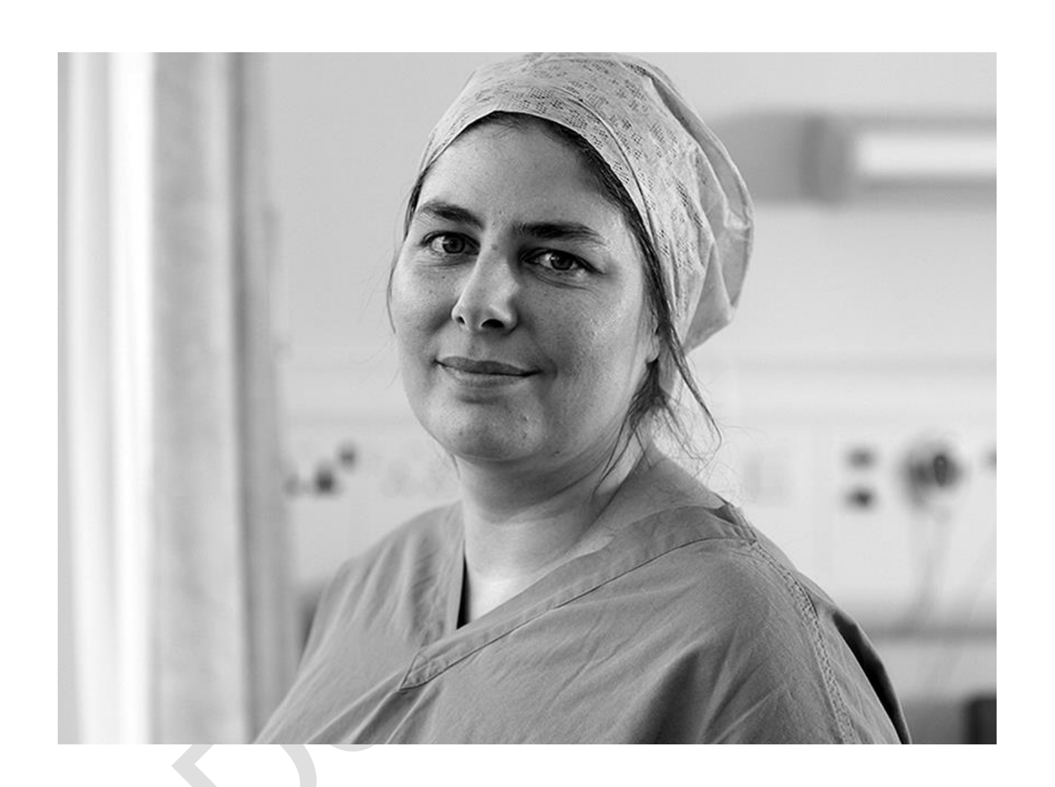
NHS Standard Contract 2017/18 and 2018/19 Particulars (Shorter Form)