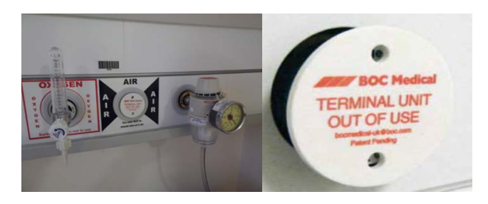
Figure 3: Air outlets have been locked in some areas

Following an incident involving confusion between air and oxygen, Great Western Hospitals NHS Foundation Trust took action to make its systems safer. The trust found that many of its medical air outlets were no longer used; for example, nebulised drugs are now given via electrically-driven devices. In these areas air outlets have been covered with lockable caps. The caps were supplied in packs of 50 and cost about 50p each.