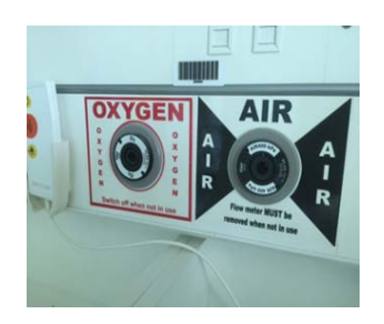
Figure 2: Example of a terminal unit warning label

Similarly to the use of flaps on medical air flowmeters, labels have a limited impact on reducing human error when implemented on their own. They can however be effective if used in combination with other approaches as they help to differentiate between different gas outlets.