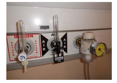
Figure 4: Only safer air flowmeters are now in use

The trust spent approximately £1,500 on implementing these changes in its 600-bed hospital.