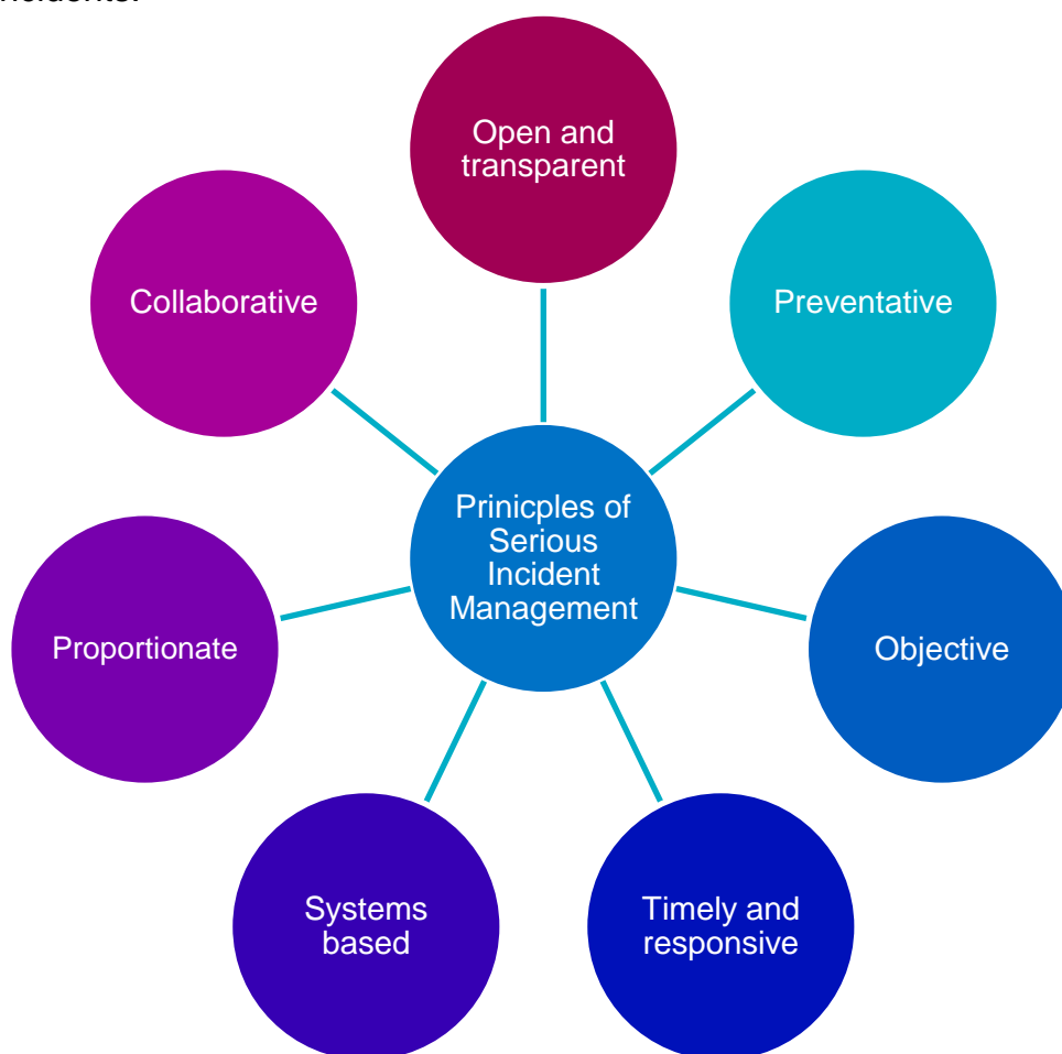
Figure 1: Principles of Serious Incident Management

This Framework endorses the application of 7 key principles in the management of all serious incidents: