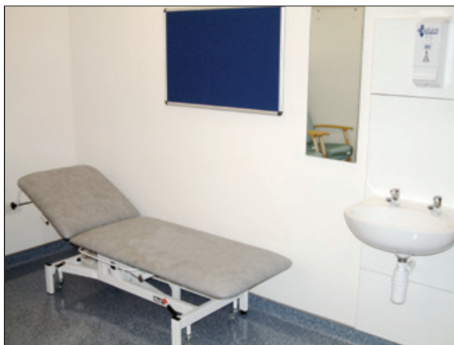
An examination couch should also be provided in the training room

of this treatment. Training is usually carried out one-to-one or in small groups. The room should be well-lit and ventilated.