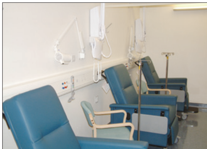
PD treatment area with treatment chairs, fluid bag holders and easy chairs for escorts