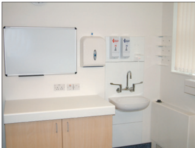
PD training room with worktop and clinical wash-hand facilities