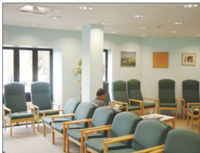
Out-patients waiting area