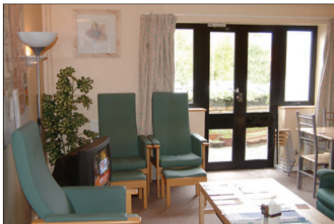
Day room where patients can sit and rest after meals