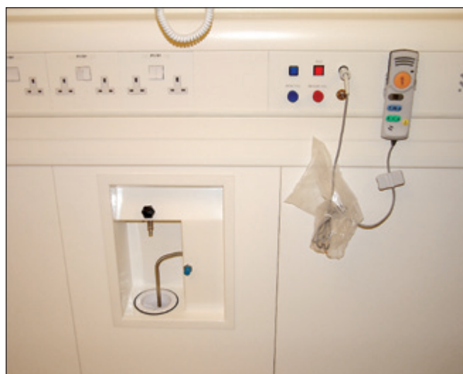
Each bedhead should have outlets for medical gases and vacuum, and (where required) be plumbed for dialysis-standard water, and have drainage outlet points