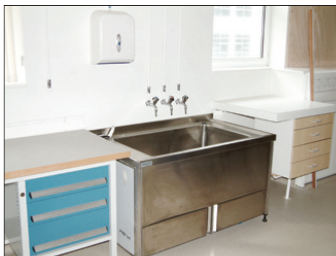
Maintenance room showing workbench and sink for cleaning of components and disposal of non-toxic fluids