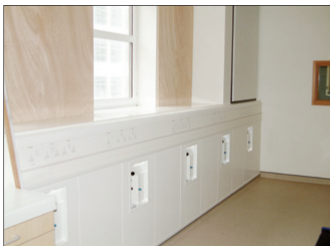
The technical services area should have a treated water supply and drainage facilities

renal unit. This facility would serve the whole renal unit, not just the haemodialysis area. The size of the area will depend on the number of renal technologists needed for the unit. This in turn will depend on a range of local factors including the number of home haemodialysis patients, haemodialysis patients, dialysis stations operating in the main renal unit, and satellite units that the main renal unit supports. For further information on workforce requirements for renal services, see 'The renal team – a multi-professional renal workforce plan for adults and children with renal disease: recommendations of the National Renal Workforce Planning Group 2002', British Renal Society, 2002.