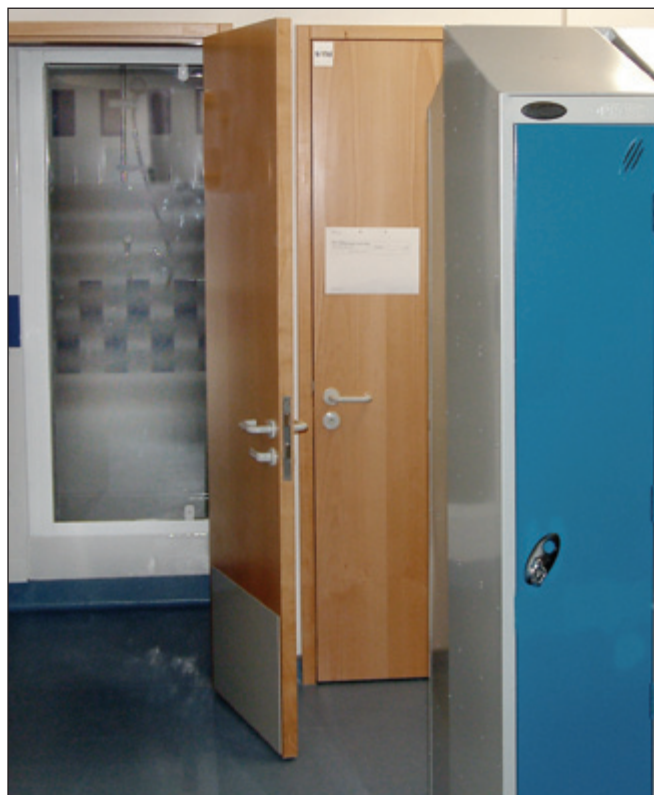
Personal full-length lockers and separate male and female showers should be provided en-suite in the staff change/locker room