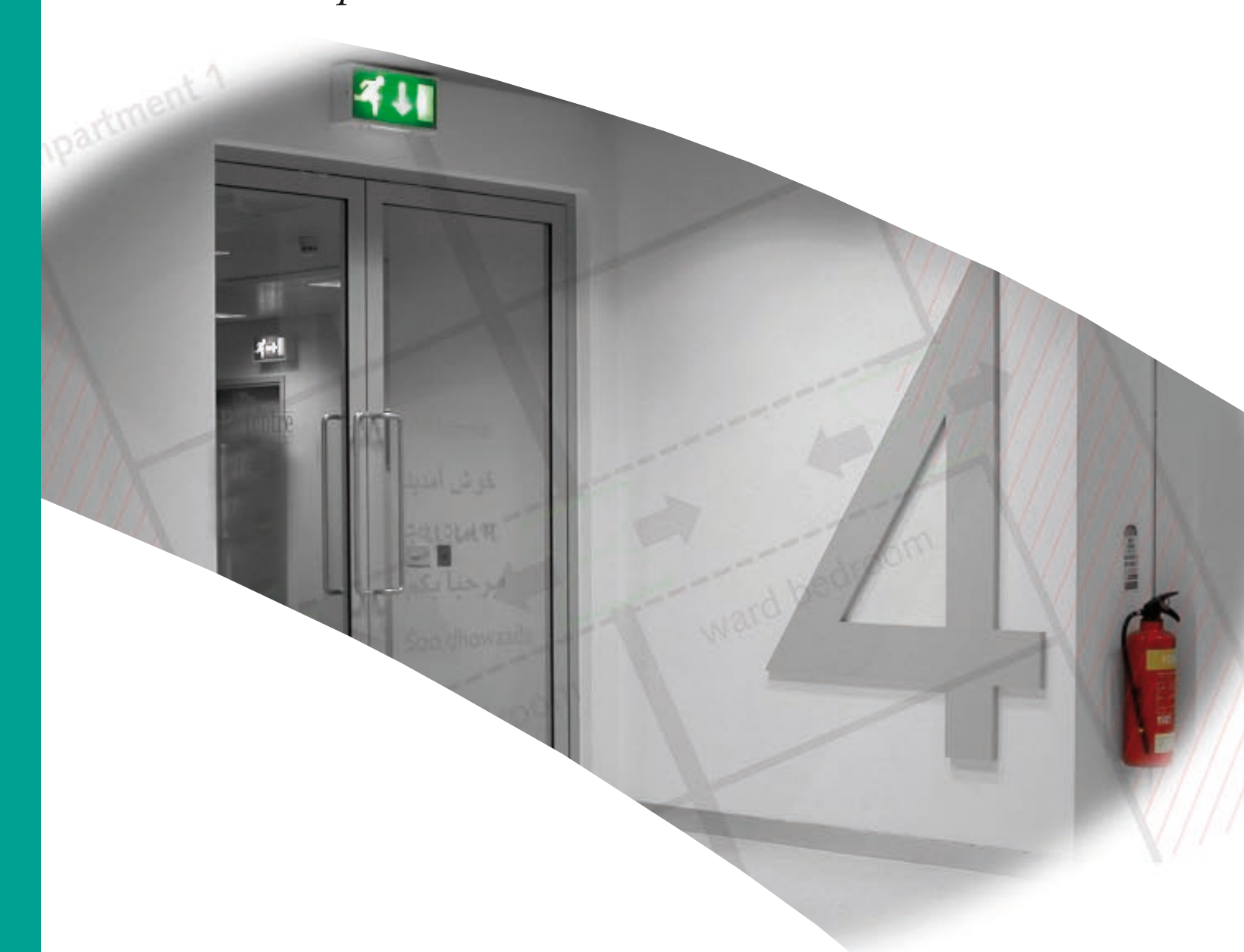
Part J: Guidance on fire engineering of healthcare premises